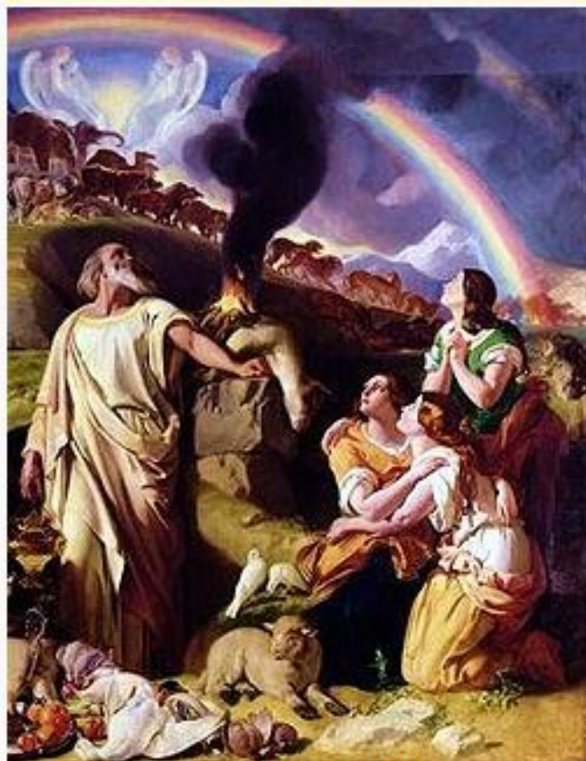
Noah's sacrifice by Daniel Maclise